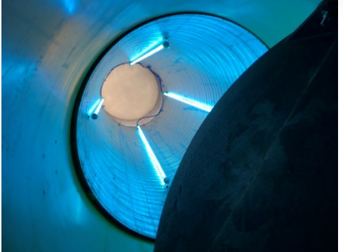
Make-Up Air & Exhaust Disinfection