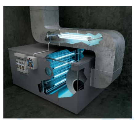
Air Handler & Airstream Disinfection